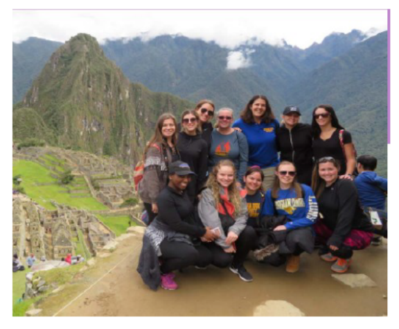
Faculty and students at Machu Picchu in Peru.