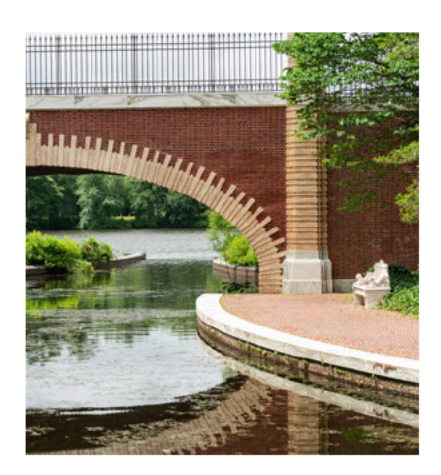
GCU's Lagoon Area