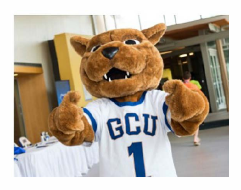
GCU Mascot Roary.

2022-2023 NASA NJ Space Grants were received by five students. They were award $2000 stipends to conduct research with professors. The 2023 NJ Women and Gender Studies UG Consortium Student Research Colloquium, hosted at Georgian Court, included five GCU students who presented their work. Seven papers and three posters from student/faculty collaborations were presented at the National Association of School Psychologists annual meeting.