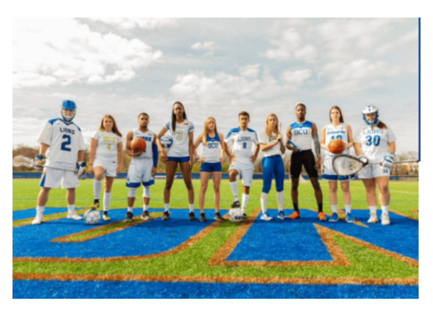
Georgian Court University Athletic Teams