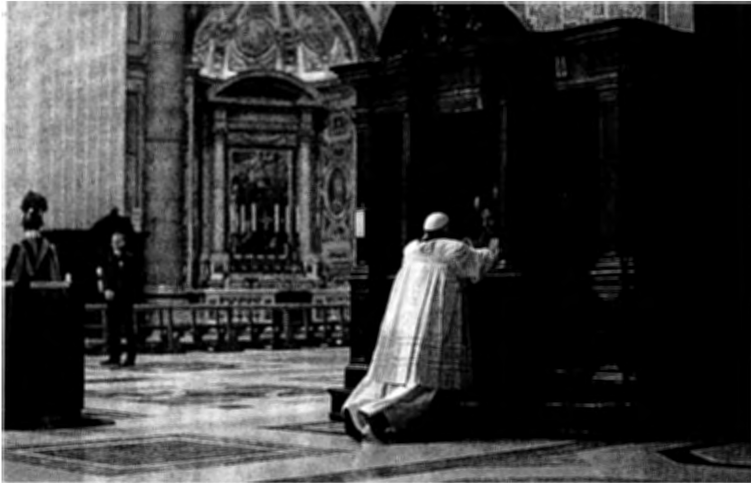
Pope Francis kneels at the confessional in St. Peter's Basilica.

ple among the throngs — like the good shepherd in the parable, his eyes seemed to search out and latch onto those in need. A member of our group noted later that the expression on the pope's face was one of intense joy and displayed a quality that "can only come from God."