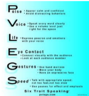
Oral Presentation Rubric