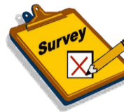
SIR II Survey