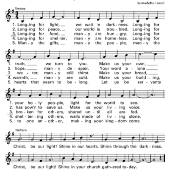
© 1993, 2000, Bernadette Farrell. Published by OCP. All rights reserved.