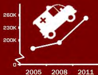
Heroin Emergency Room Admissions Are Increasing 5

14% of non medical prescription pain reliever users are dependent 54% of heroin users are dependent 4