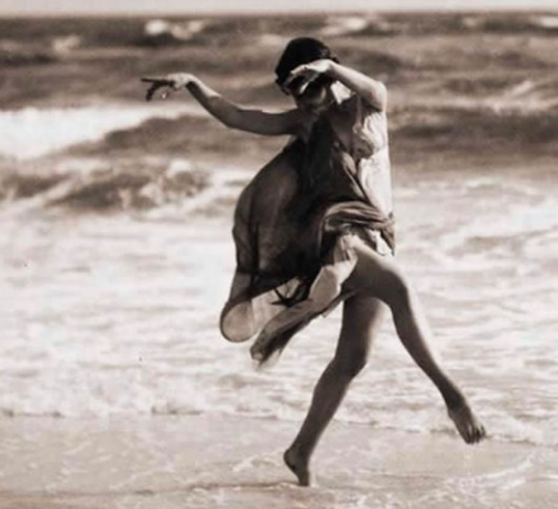
Isadora Duncan danse sur la plage